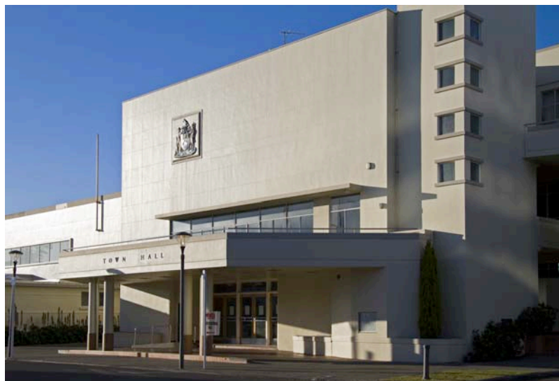
Hutt Town Hall.

Controversy has been building since the Hutt City Council announced late last year its intention to demolish the Town Hall and adjacent Horticultural Hall. The intention is to replace them with a new facility sometimes called a convention centre.