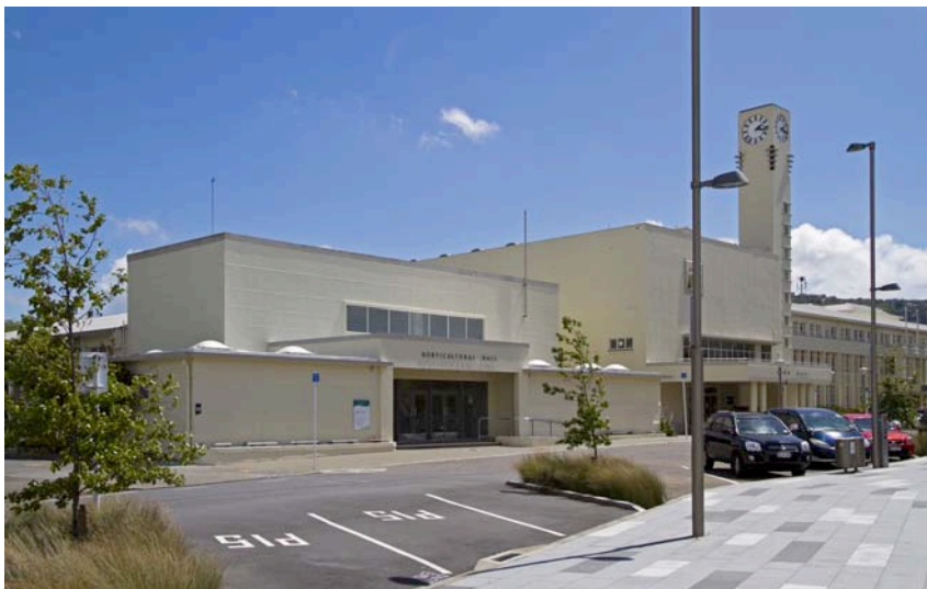
Hutt Horticultural Hall.

There has been widespread dismay at the Council's decision which shows scant regard for the qualities of the buildings and their contribution to the Hutt community over six decades. There was no consultation with the community before the decision, and because of the way the land is designated there is no opportunity for public submissions. The Council's decision lacked a solid economic analysis and there are doubts whether a convention centre in the Hutt Valley would be viable.