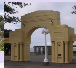
The New Napier Arch.