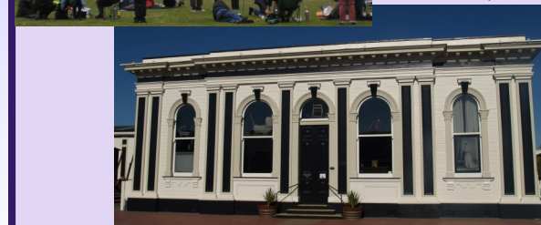
CHB Settlers Museum, Waipawa.

HAWKE'S BAY'S NEW HERITAGE ADVOCACY ORGANISATION